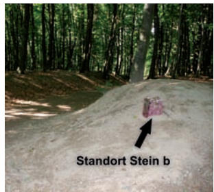
Place of the stone (b)