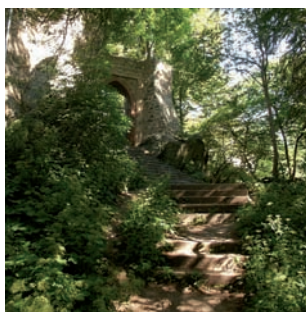
Picturesque small sally gate