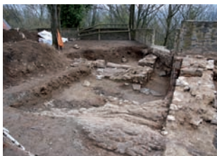
Excavation at the eastern side of the core-castle