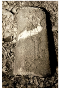
Top of the stone (b)

The boundary stones at the northern wall of the castle chapel (15) date from 1556. Stones remaining from this period are very rare. These stones had to separate the district Seeheim from Frankenstein's territory. Seeheim was under the rule of the Counts of Erbach. At the left stone (a) the sign of the "Hippe" (a former vine knife) can be seen. It is also shown at the northern wall of the old town hall of Seeheim, and it is still today part of Seeheim's emblem. The missing upper part of the right stone (b) was also marked with this sign. 2008 both historic stones were brought up to the castle for protection against vandalism. Originally, they were placed on the border between the municipalities Seeheim-Jugenheim and Muehlthal (territories Malchen and Nieder Beerbach). Boundary stones showing Frankenstein's coat of arms were found in Ockstadt, Frankfurt and Buerstadt, but not near the castle. It is quite possible that they had been taken away by the Landgraf of Hessen-Darmstadt 1662.