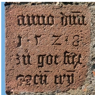
Family's motto at the inner tower