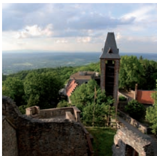
View from the core-castle to the north

The core-castle is the oldest area of the site and dates partly from the time of foundation. It was surrounded by a 2 yards thick polygonal curtain wall (1). Buildings leaned closely thronged against it. The quarrystone work had a roughcast.