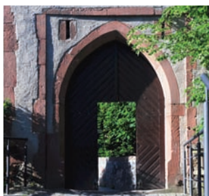
Gate of the gate-tower