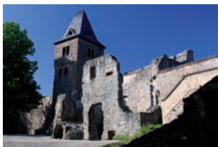
Western side of the core-castle